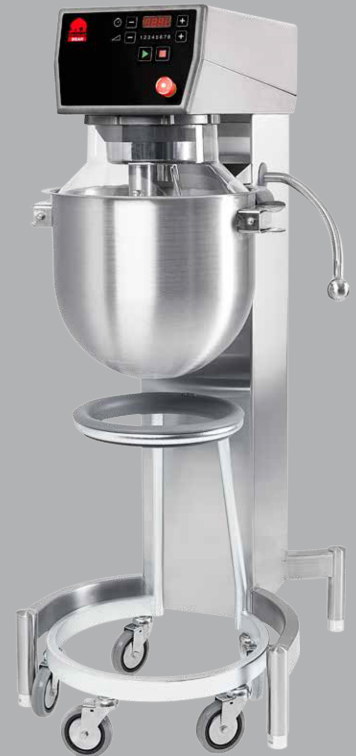
KODIAK – mixing at a higher level